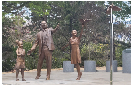
"The Mountain Top"