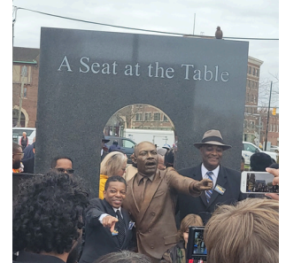
"A Seat at the Table"

Standing in the midst of a crowd at the Margaret B. Upton Arboretum, you could feel the sense of awe and singleness of vision as civic leaders and community members came together for the unveilings of the Martin Luther King, Jr. monument. His eldest son, Martin Luther King, III presided as the honored guest and speaker at the celebration of the double unveiling. All the young people in the audience were invited to come and participate in removing the cloth. Following the unveiling, a march, complete with the cadence of the drums, commenced over the bridge to the Dwight P. Mitchell Park in Benton Harbor the for 2nd half of the unveiling. From there the program made another journey to Lake Michigan College for, "A Conversation with Martin Luther King, III". At the Grand Upton Hall, Dr. King touched on his life growing up as a son of Martin Luther King, Jr., and the hope of the monuments bringing the two communities together in unity.