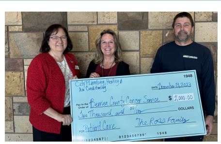
City Plumbing, Heating & AC Donation

Our Lady of the Lake School October fundraiser